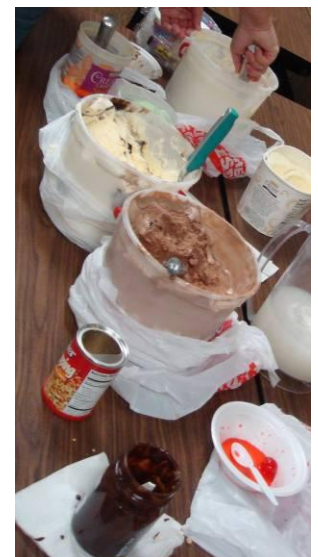
HOTARC Ice Cream Social