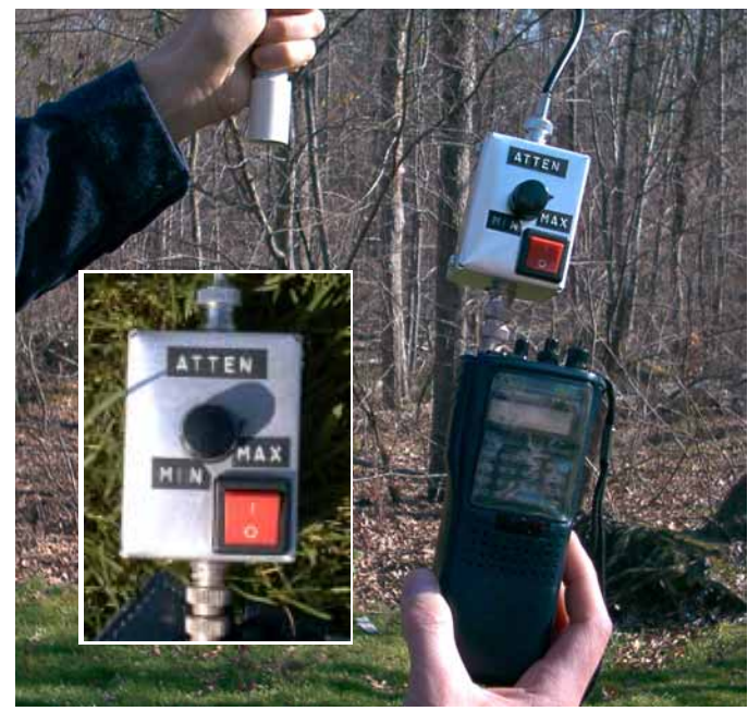
More Fox Hunt Equipment - NZØI uses this clever "offset attenuator" to reduce the signal from the Fox when working in close. Details at www.qsl.net/nz0i